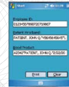
Label Printing on Windows Mobile Device